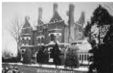
Sorrento Maternity Hospital

The Birmingham Women's Hospital Neonatal Unit is experienced at looking after premature babies born from just 23 weeks and some of the sickest babies nationwide.