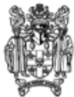
The Royal College of Anaesthetists

The Patient Information Unit, Churchill House, 35 Red Lion Square, London WC1R 4SG email: admin@youranaesthetic.info